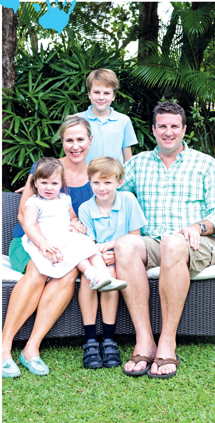
UWC South East Asia has two campuses: Dover and East 6775 5344 | uwcsea.edu.sg